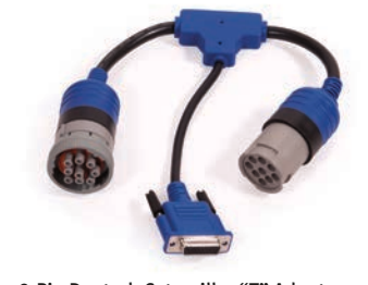
9-Pin Deutsch Caterpillar "T" Adapter PN 493014

16-pin J1962 (OBD II) adapter. Supports connection to all J1962 vehicles (Ford, GM, Dodge, Volvo/MACK, Isuzu, Hino).