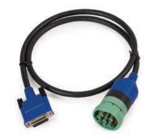
9-pin Deutsch Adapter (Locking 1 Meter) PN 493101

9-Pin Adapter—Covers 1998 to present Class 4-8 heavy-duty OEM and Tier 1 suppliers; J1708, J1939, CAN1, CAN2, CAN3.